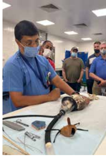
Falcon hospital in Abu Dhabi.