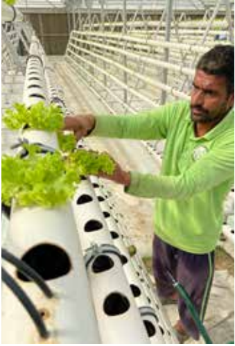
A vegetable hydroponic facility