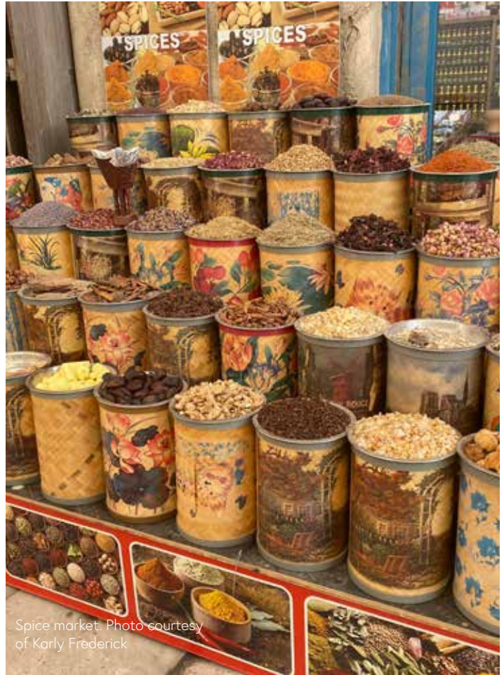
Spice market.