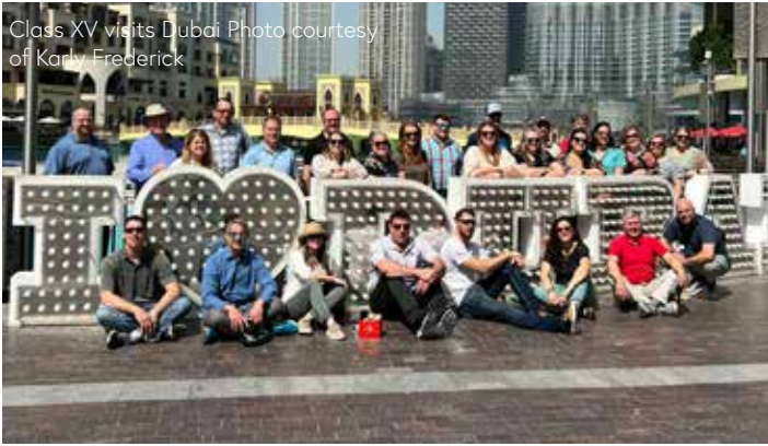
Class XV visits Dubai