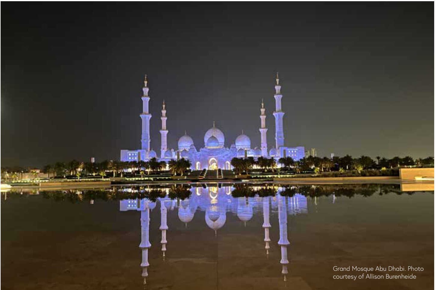
Grand Mosque Abu Dhabi.