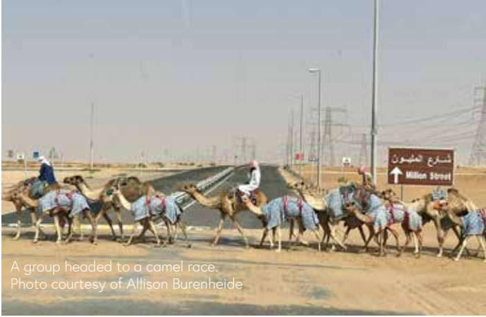
A group headed to a camel race.