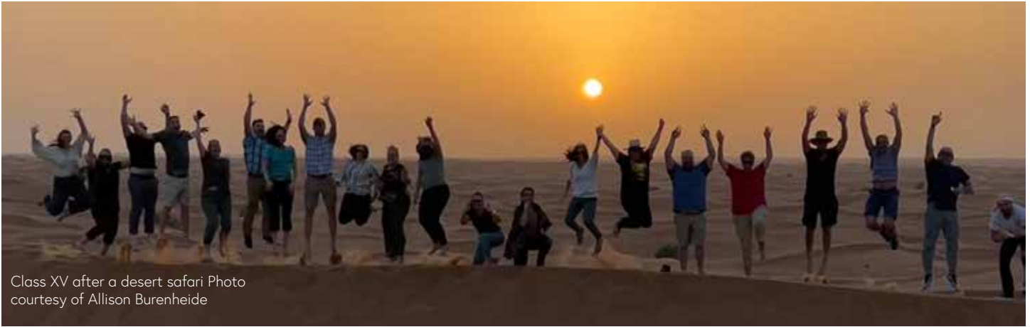
Class XV after a desert safari