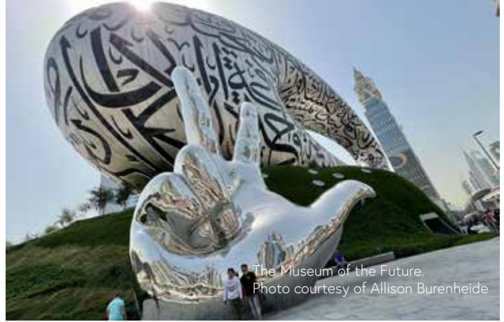
The Museum of the Future.