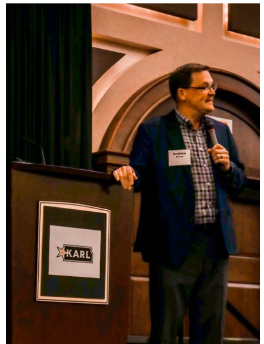
Top: KARL Big Event celebrated new Fellows and incoming Associates.