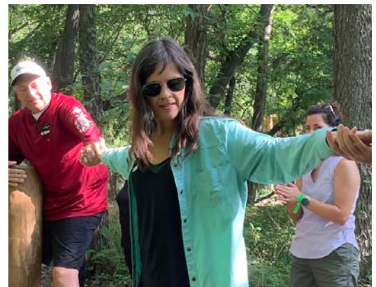
Top: Class XVI at Kansas Department of Agriculture in Manhattan.