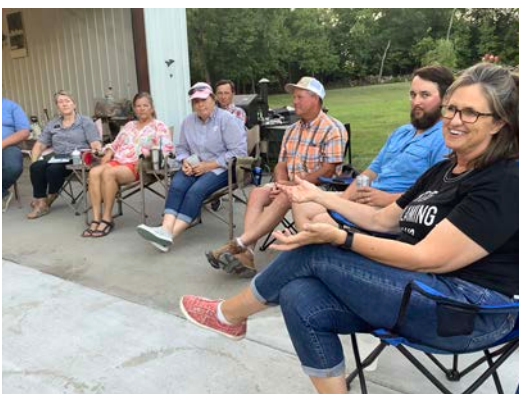
Top: Class XVI team building at Rock Springs near Junction City.